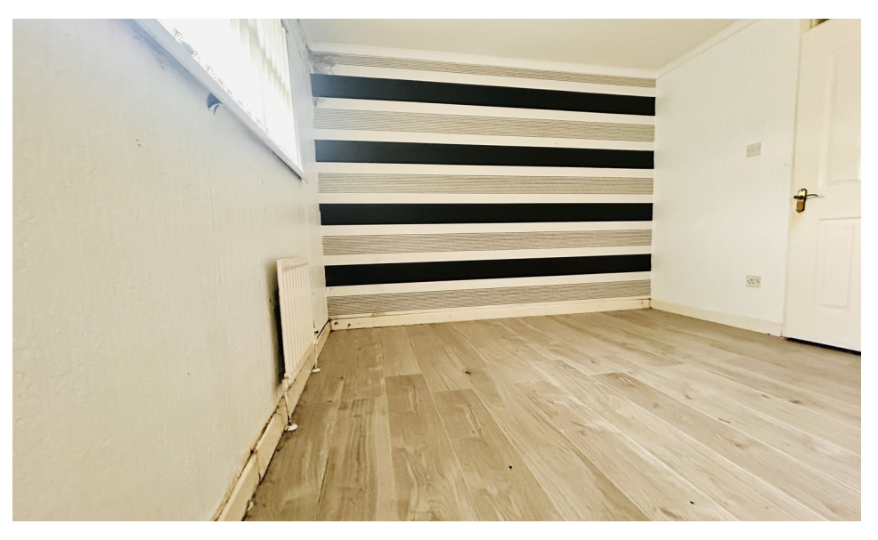
BEDROOM 1: 3.64m (11'11) x 3.55m (11'8) Laminate flooring, double glazed