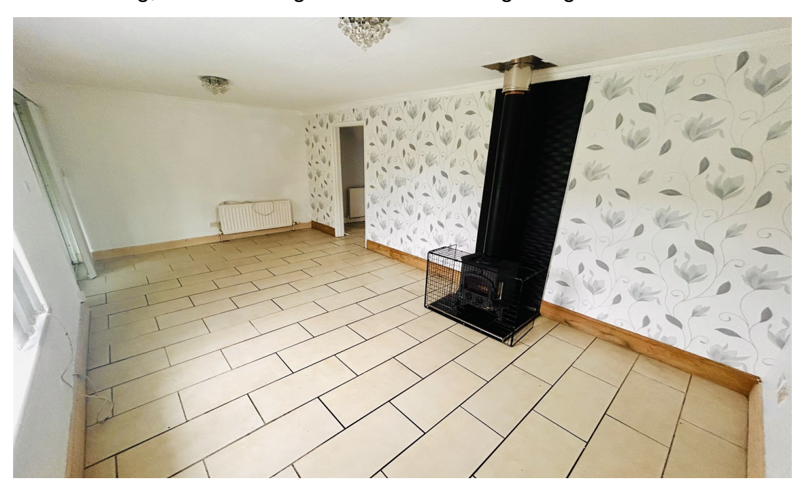
KITCHEN: 4.77m (15'8) x 3.19m (10'6)

Tiled flooring, wood burning stove and double glazing.