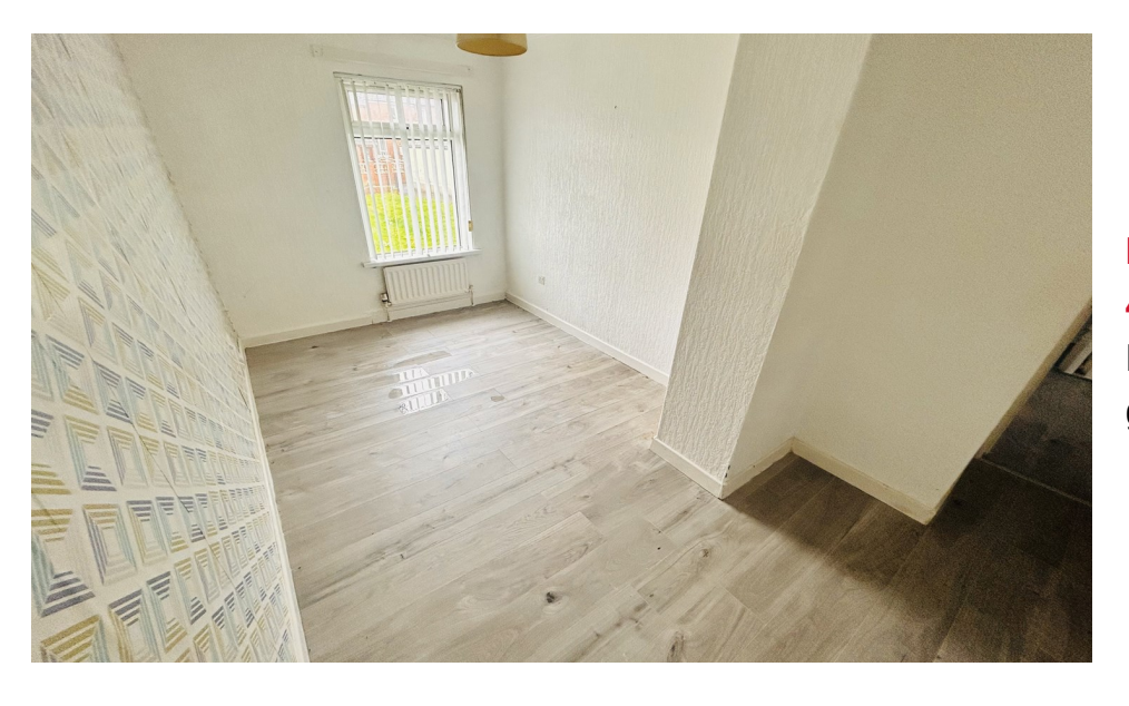
BEDROOM 2: 4.47m (14'8) x 2.31m (7'7) Laminate flooring, double glazing