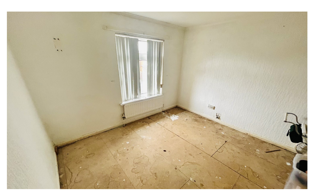
BEDROOM 3: 4.47m (14'8) x 2.31m (7'7) Double glazing